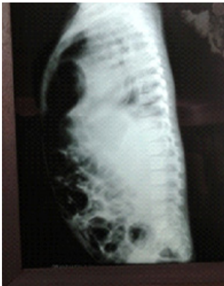
Figure 3. X-ray chest Lateral view.