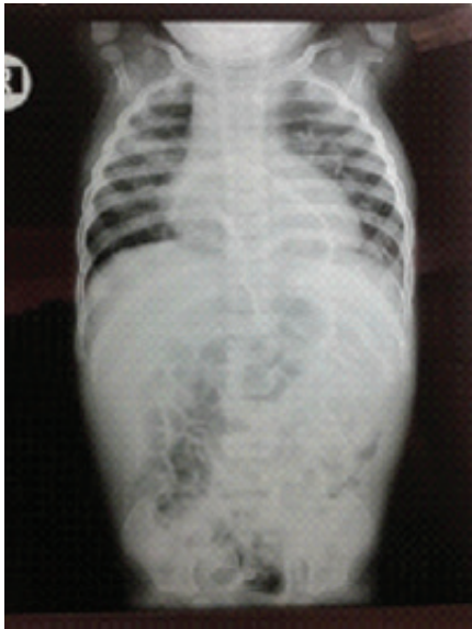
Figure 2. NTS: X- ray chest antero posterior view.