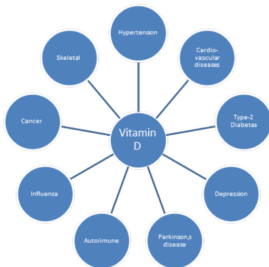
Figure 2. Benefits of vitamin D.

Many studies have shown association between low vitamin D concentrations and increased risk of fractures and falls. Vitamin D receptors are located on the muscle