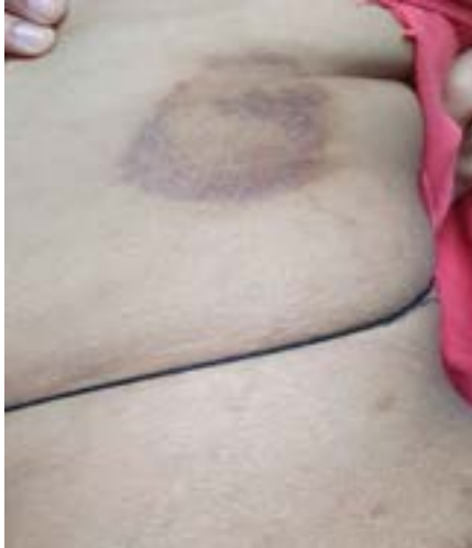
Figure 1. Well defined annular erythematous plaque with popular borders.