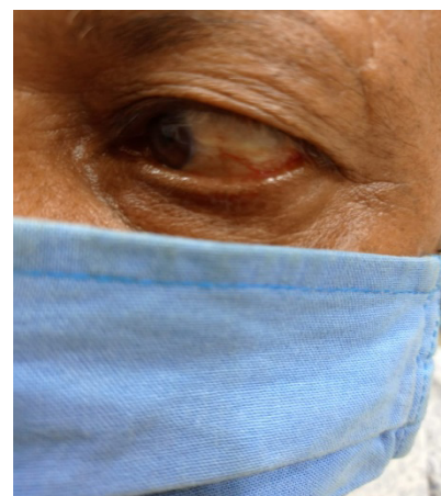
Figure 1. Subconjunctival hemorrhage after treatment.

Subconjunctival hemorrhages do not seem to have any sort of gender discrepancy. However, in young males, the prevalence rate of SCH is found to be high. It is usually seen in a person performing heavy and rigorous active tasks 4 . The elastic and connective