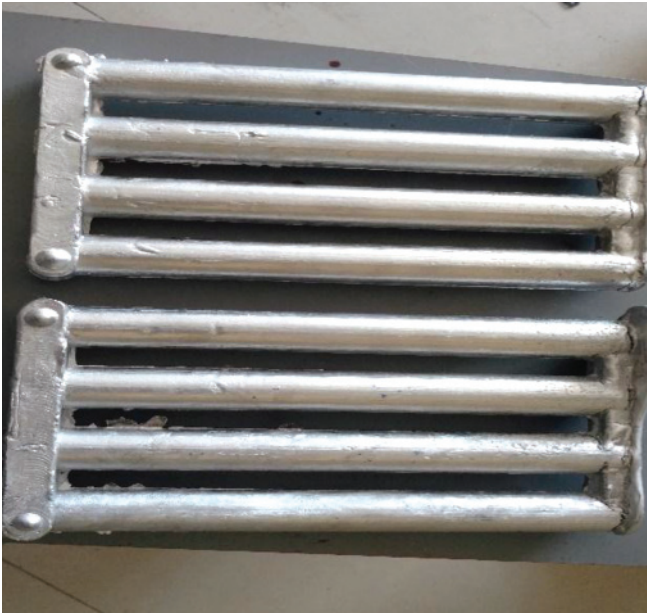
Figure 5: Casted specimens