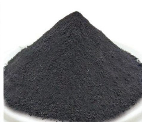
Figure 4: Molybdenum disulfide (MoS 2 ) powder