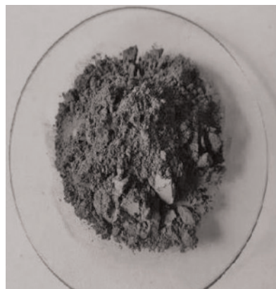
Figure 2: Niobium Carbide (NbC) powder