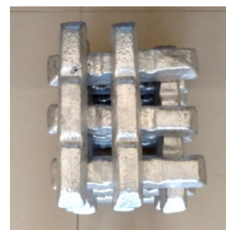
Figure 1: Al7475 Ingots

The proposed work is to fabricate and determine the mechanical properties, such as the hardness and fracture toughness of Al7475+NbC and AL7475 + MoS 2 composites. The composites were developed by liquid metallurgy technique.