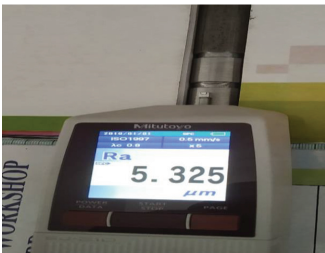
Figure 2: Surface Roughness Measurement

Optimum experimental trials were planned by L9 Taguchi orthogonal array principle. The experimental trials were carried out by using the experimental set up, showed in the Figure 1. The surface roughness for each trial was measured using Talysurf instrument, shown in Figure 2 and tabulated in the Table 2.