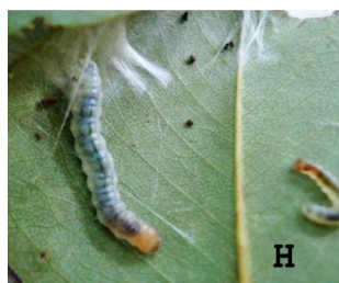
Fig. 8. H- Pyralidae host caterpillar.

Unidentified Pyralidae (Figures H and I). Cocoons formed gregarious (Figures J and K).