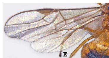
Fig. 5. Cassidibracon repens sp. n. E - Wings.

Lengths of fore wing veins r: 3-SR: SR1 = 0.11: 0.28: 0.54. 1-SR+M = 0.35.