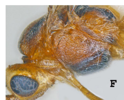
Fig. 6. Cassidibracon repens sp. n. F - Mesopleuron.

Length of hind femur: tibia: tarsus = 0.57: 0.76: 0.56. Hind tibia 9× longer than its maximum width.