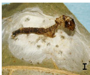
Fig. 9. I - Caterpillar carcass with cocoon mass.