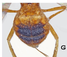
Fig. 7. Cassidibracon repens sp. n. G - Metasoma.

median smooth triangular depression in apical half. Second tergite with light yellow median field bordered by anteriorly converging sublateral carina, coarsely rugose, apical one-third with black infuscation and coarse longitudinal striations. Second tergite 1.99× wider than medially long. Midlongitudinal carina extending from second tergite (little below the basal margin) up to the fourth tergite. Third tergite medially black with coarse longitudinal striations, 3.43× wider than medially long. Fourth tergite with coarse longitudinal striations. Remaining tergites shallowly punctate. Exserted ovipositor length = 0.63. Ovipositor length 0.54× longer than gaster.