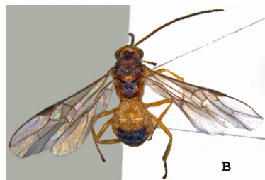
Fig. 2. Cassidibracon repens sp. n. B - Dorsal view.