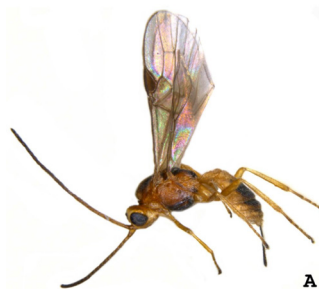
Fig. 1. Cassidibracon repens sp. n. A - Habitus.

Figures 1 and 2. Measurements in mm. Body length. 3.12 (Holotype, habitus); fore wing length 2.59; antenna length 2.43.