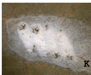
Fig. 10. K - Cocoons.