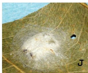
Fig. 9. J - Cocoons.