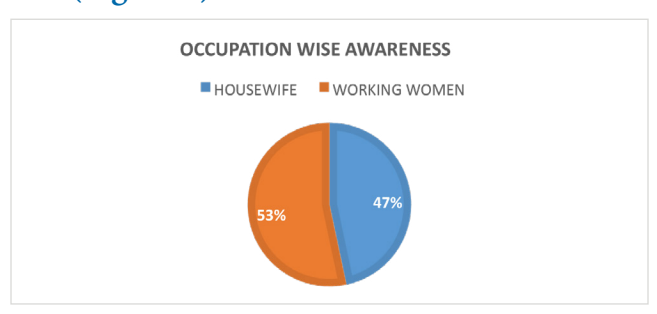
Figure 2. Awareness based on occupation.