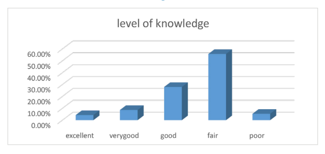
Figure 3. Overall result.