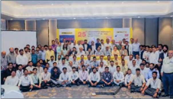
25th foundation day of IIW-India, Baroda branch is celebrated on 7th October 2023 at Hotel Marriott, Vadodara. Theme was "Welding industry in India – Challenges and Application". Total 100 participates took part in this event.