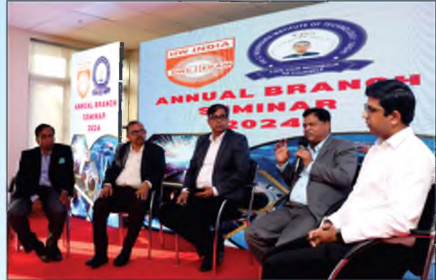
Speakers during panel session at Annual Branch Welding Seminar Event