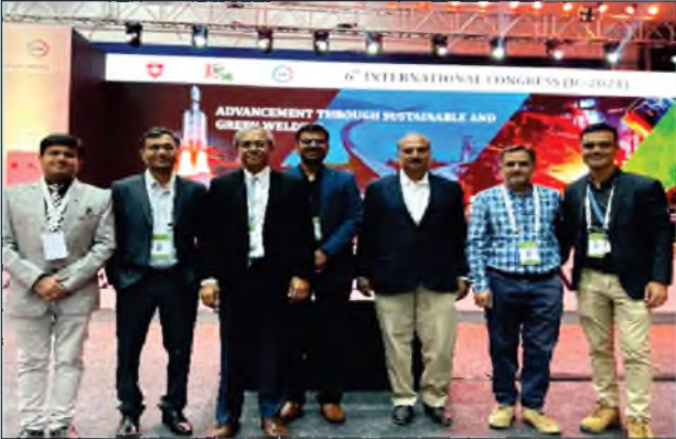
Attended 6th IC 2024 on "Advancement through Sustainable and Green welding" at BIEC, Bangalore during 22nd to 24th January