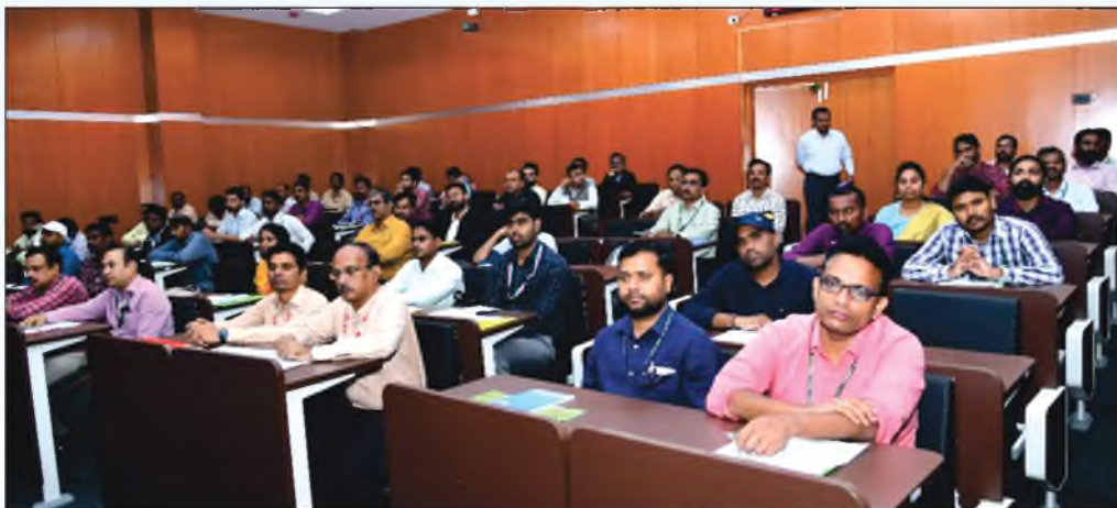
AWTNMP 2024 : Registered participants from Academia, R&Ds, Industries & DRDO labs