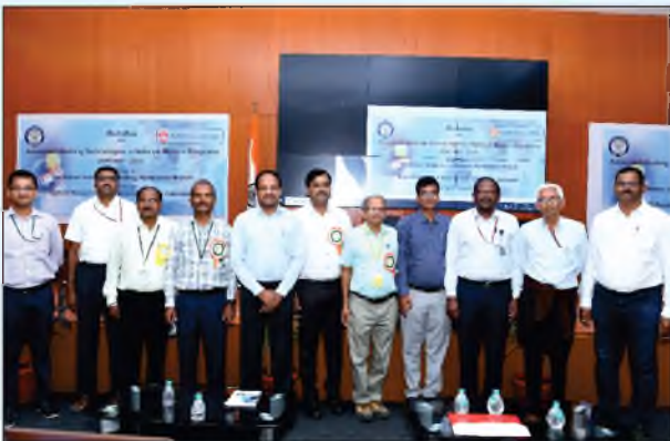
AWTNMP 2024: Organizing committee members of DRDL and IIW-Hyderabad