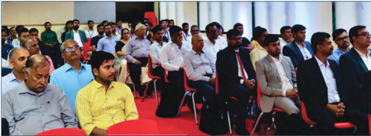
Delegates during the Annual Branch Welding Seminar