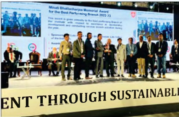
Attended to receive Minati Bhattacharjee memorial award for the best performing branch 2022-23 during IC-2024 at BIEC, Bangalore during 19th to 22nd Jan 2024.