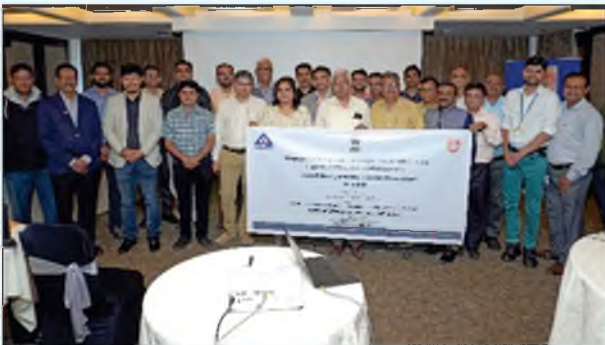
One day seminar on "Developments in Quality Management in the field of welding" organised by BIS in association with Baroda Branch on 9th December at Hotel Express Towers, Vadodara. Total 75 participates took part in this event.