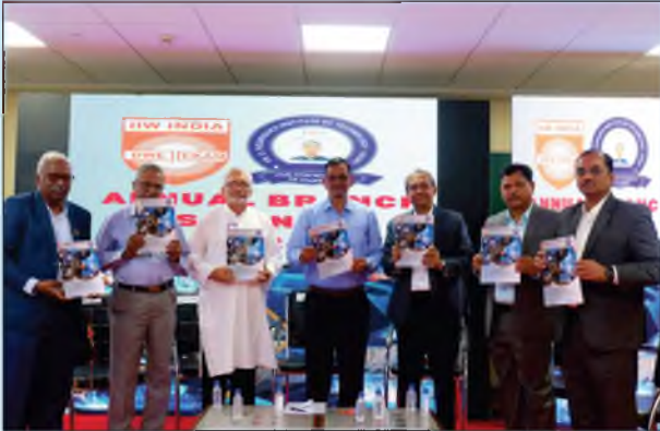
Dignitaries on the dais releasing the Souvenir copy of Annual Branch Welding Seminar – IIW Mumbai Branch