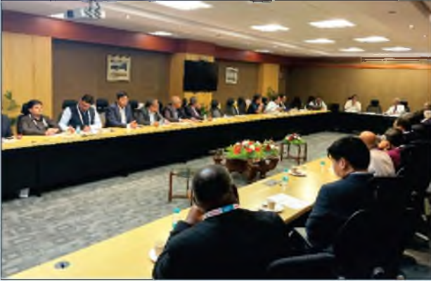
Attended 335th Council meeting at BIEC, Bangalore on 23rd January