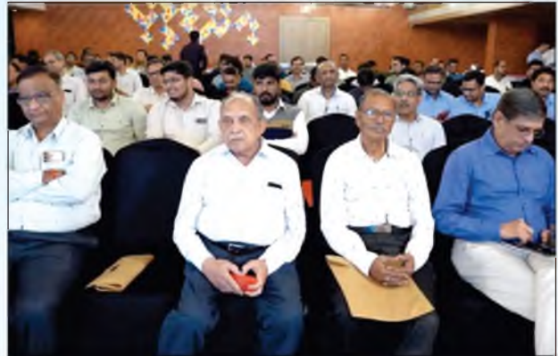
On 07 February-2024, Indian Society for Non-Destructive Testing – Vadodara Chapter, The Indian Institute of Welding – Baroda Branch and Baroda Management Association had jointly organized an evening lecture on topic “Significant Advances in Surface NDT Methods” at Hotel Tarasuns, Vadodara. Around 105 participants had attended the evening lecture.