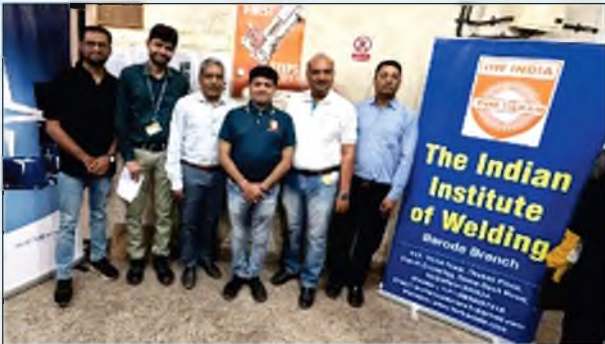
Branch level best welder competition held on 25th November at M/S.Anuptech, Baroda sponsored by Bohler India. Total 31 participates took part including woman welder.