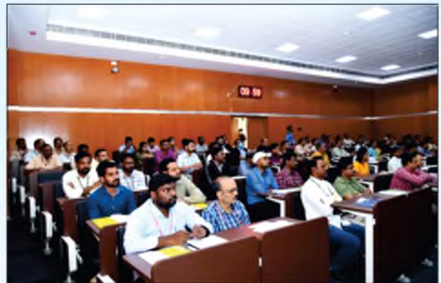
AWTNMP 2024: Registered participants from academia, R&Ds, industries & DRDO labs