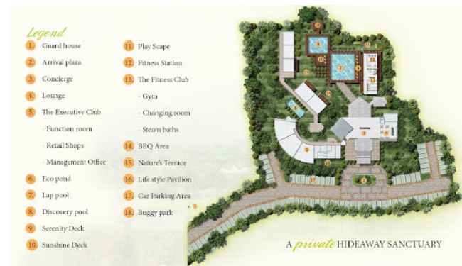
Figure 2. Layout of a condominium.

Mine/plant pays for water, sewer, public area lighting, trash removal, and parking and wired or wireless connection to the main network. Upon move-in, the employee will contact the facility manager to transfer utilities into his/her name(s) in consultation with the utility provider for both gas and electric. A parking pass may be required to park at condominium. Units include a stove, dishwasher and refrigerator. One must bring any additional appliances one may require. The general layout of a condominium looks like as in Figure 2.